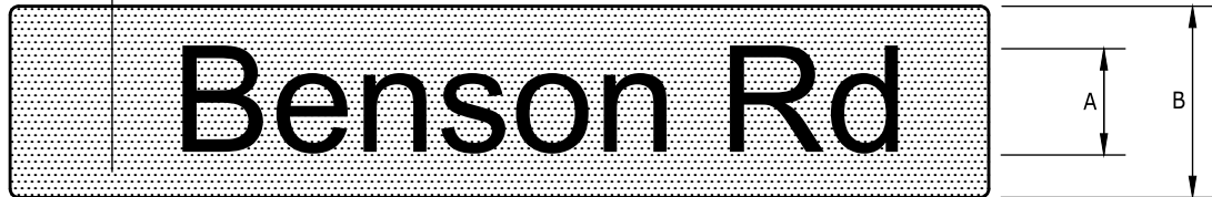
PUBLIC STREET NAME SIGNS (GREEN)

2" MIN. SPACE FOR CANTILEVER MOUNT (TYP.)