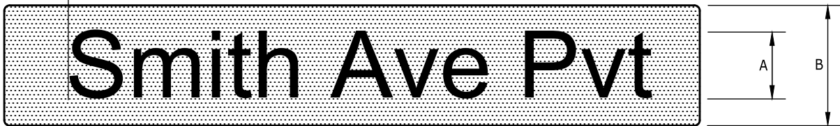
PRIVATE STREET NAME SIGN (BLUE)

2" MIN. SPACE FOR CANTILEVER MOUNT (TYP.)