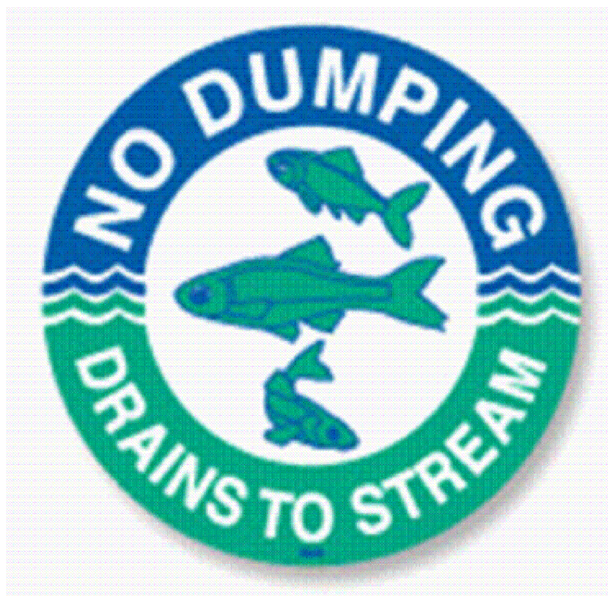
PRIVATE CATCH BASIN MARKER