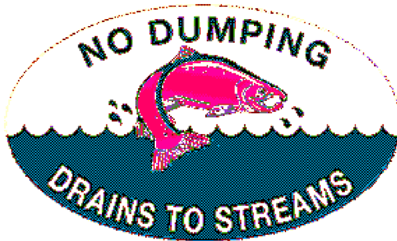
PUBLIC CATCH BASIN MARKER