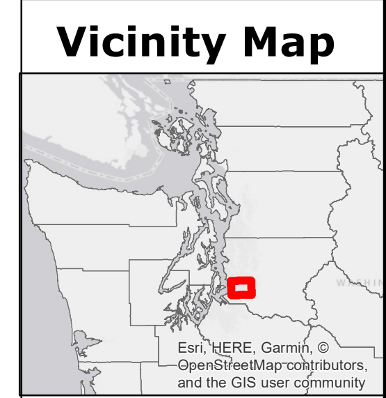
Figure 9-16 Capital Improvement Projects All Projects, System-wide City of Kent 2019 Water System Plan

This map is a graphic representation derived from the City of Kent Geographic Information System. It was designed and intended for City of Kent staff use only; it is not guaranteed to survey accuracy. This map is based on the best information available on the date shown on this map. Any reproduction or sale of this map, or portions thereof, is prohibited without express written authorization by the City of Kent. This material is owned and copyrighted by the City of Kent.